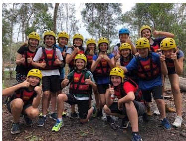
Kindilan Activity Day

Thank you to all Year 7 students who were involved over the two days, your behaviour was exemplary and it was great to see you all having fun and making new friendships.