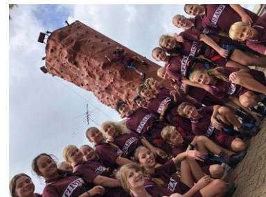
Rocking climbing at school