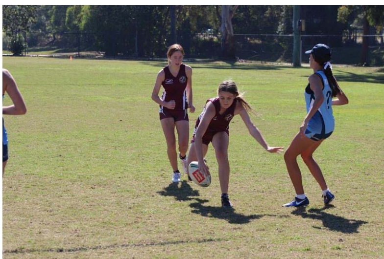
CDSHS Touch of Excellence: Cleveland's Sports Development Touch Football program has been awarded as a School of Excellence