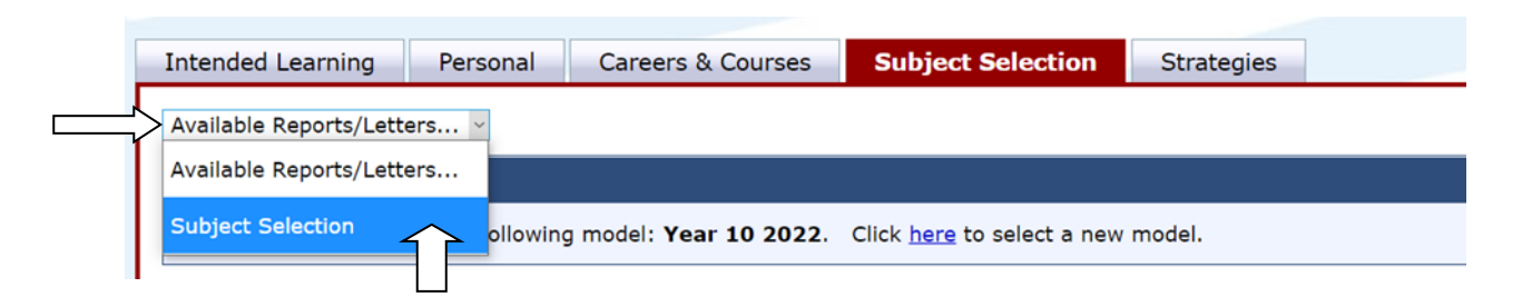
Step 5: To print your Subject Selections Click on "Return to Subject" Selection

Drop down the "Available Reports/Letters" box and choose "Subject Selection".